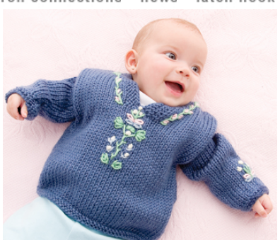
click to enlarge image schematics